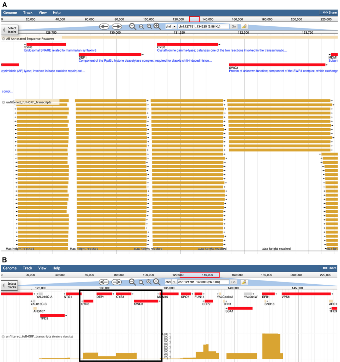
Figure 1. Unfiltered transcript isoforms that overlap ORFs displayed at various levels of zoom in JBrowse. (A) Individual glyphs representing each transcript isoform are visible at close zoom. (B) At lower magnification, the same region (outlined in the box) is displayed as a collapsed histogram.

and includes a direct download link to a zipped folder of all the track files ( https://sgd-dev-upload.s3.amazonaws.com/S000246061/Pelechano_2013.PMID_23615609.zip ).